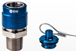
N200P COOLANT NOZZLE & PLUG PIN LATCHING