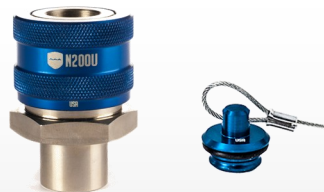
N200UP COOLANT NOZZLE WITH PLUG, BALL LATCH, 3/4"