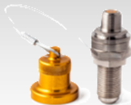
R300JC * HYDRAULIC RECEIVER & CAP