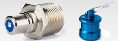
R200RC # "R SERIES" COOLANT RECEIVER & CAP