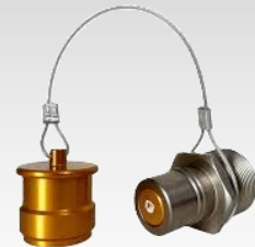
R300RC # "R SERIES" HYDRAULIC RECEIVER & CAP