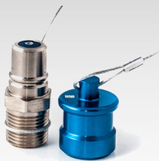
R200C COOLANT RECEIVER & CAP