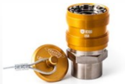
N300P HYDRAULIC NOZZLE & PLUG PIN LATCHING