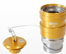
N300BP HYDRAULIC NOZZLE WITH PLUG, BALL LATCH, 3/4"