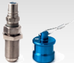
R200JC * COOLANT RECEIVER & CAP