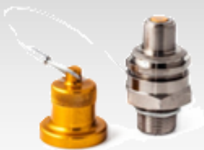
R300C HYDRAULIC RECEIVER & CAP