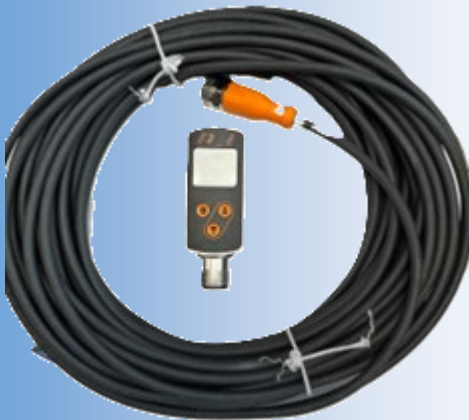
OIL LEVEL SENSOR