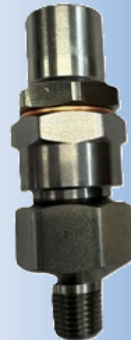
OUTLET CHECK VALVE