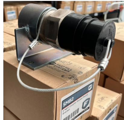
Standard 2" NPT Diesel Receiver