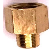
GF14018 ADAPTOR, BRASS, 1/8BSP M